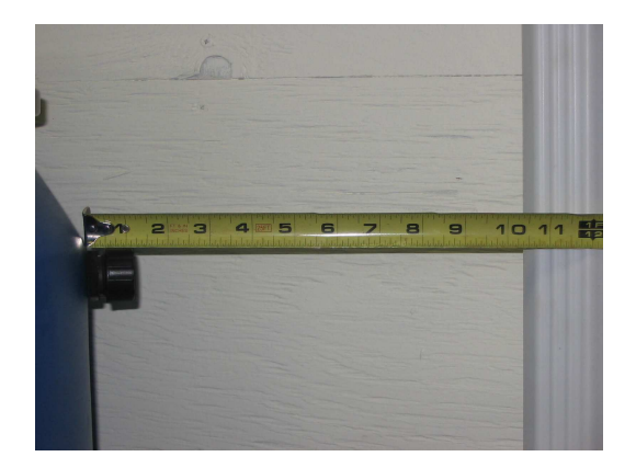
3. Measure across from overflow (top) fitting on rain barrel when it is at installed height and mark downspout at same level.