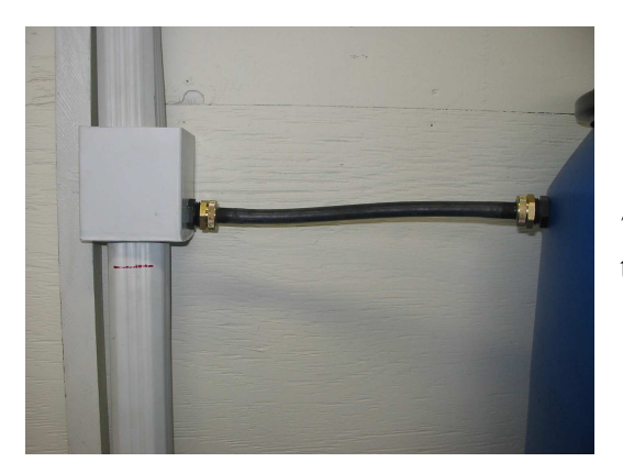
7. Connect diverter to your rain barrel using the provided hose.

When it rains water will flow from the diverter, through the hose to your barrel and will also continue to flow through the diverter to the lower half of the downspout. When the barrel is full then all the water will proceed down the downspout.