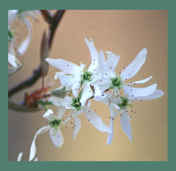
Pick up Friday, April 17th and Saturday, April 18th

Pre-order your trees, shrubs and native plants for pick up this Spring: