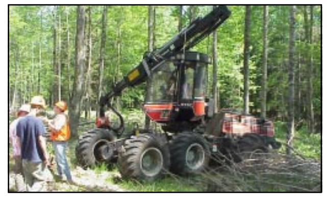
Modern logging equipment like this feller-buncher cuts the tree, bucks logs, and piles logs to be picked up by another machine and hauled to log landing.