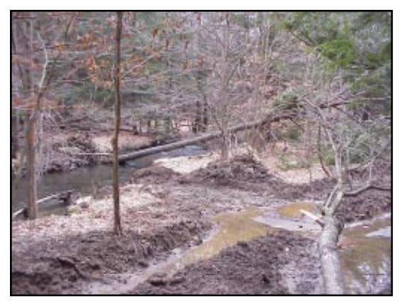
Logging during very wet weather and in areas adjacent to streams can cause severe rutting and sedimentation of streams.