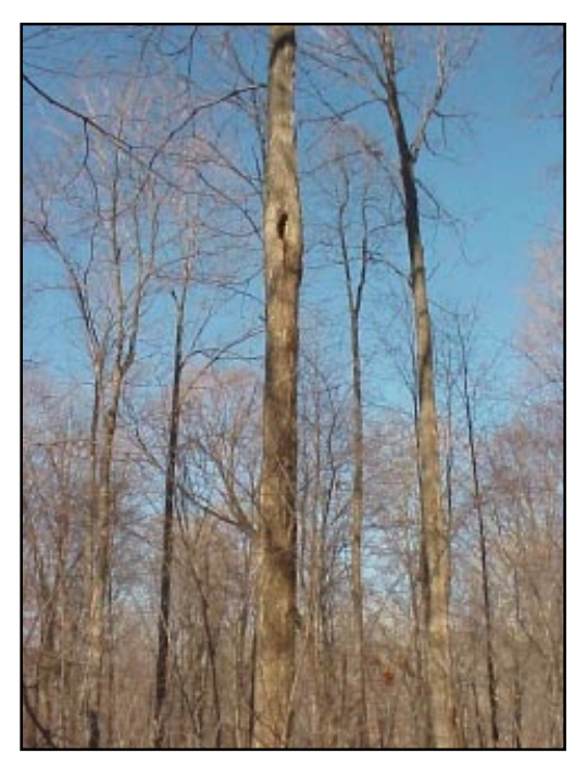
Cavity in this tree may indicate that it should be removed in the next harvest. However, if wildlife is an important goal, your forester may recommend leaving it stand.

regardless of the designation method used. The volume of trees to be marketed for sawlogs and veneer logs is measured in board feet according to the Doyle Log Rule. See FNR-191, Log and Tree Scaling Techniques . Pulpwood is sold by the ton or cord. Use this volume data and the price estimates to calculate a possible range in fair market value. If you are working with a consulting forester, he or she should provide you with this estimate. Use it only as a guide to evaluate purchase offers or bids.