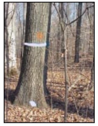
Red oak properly marked for sale. White band and basal spot were made by a consulting forester. Circle was made by timber buyer who assessed marked timber for possible bid.

1. Professional Assistance. Most landowners probably don't market timber very often; however, timber buyers do this for a living. Their employers expect them to purchase, at minimum cost, timber that meets their company's needs. As such, the landowner most likely will be at a disadvantage in this process. Assistance from a professional forester who earns his or her living in part by marketing timber for landowners is recommended. In Indiana. limited marketing assistance is available at no charge from District Foresters employed by the Indiana