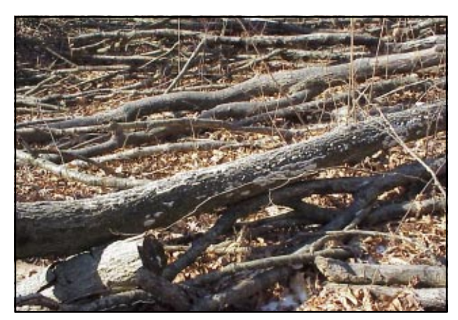
Decay of logging slash less than two years after the harvest.

Best Management Practices (BMP). These are guidelines loggers follow to minimize the impact of logging on water quality. The focus is on sedimentation of waterways from soil erosion both during and after logging. You can review BMP's by requesting an Indiana BMP Guidebook from the Indiana Division of Forestry or on line at <u>http://www.state.in.us/dnr/</u> <u>forestry/bmp/log1.htm</u> BMP's are also discussed in FNR-184.