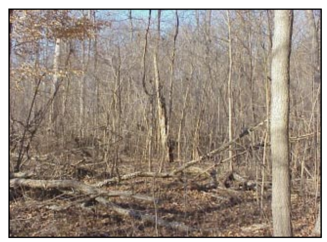
Excellent regeneration 10 years after a salvage harvest necessitated by a severe wind storm.