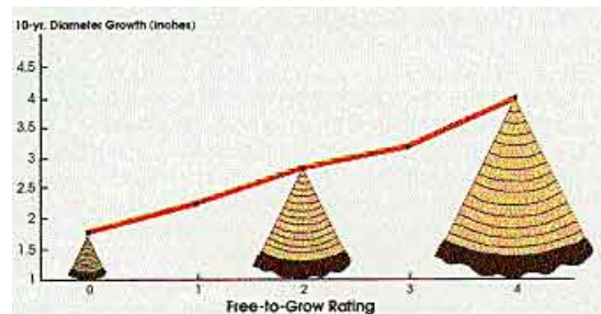
Figure 3. This graph shows how an increase in free-to-grow rating from a crown-touching release can dramatically increase crop-tree growth. (From: Crop Tree Management in Eastern Hardwoods . USDA-FS.)

Trees to be removed may be cut or deadened. In some instances, enough trees of suitable size may be cut to warrant a commercial timber sale. More commonly, the trees being removed will be too few or too small to be marketable. In such instances, the trees can be cut for landowner use (firewood, fence posts, etc.) or deadened in place by girdling or other appropriate technique. Girdling can be accomplished by using a chain saw to cut through the bark and about one inch into the wood of the tree around its entire perimeter. Double girdling, with a second girdle about three inches above the first girdle, is even more effective. Properly girdled trees will die standing and will slowly decay, providing habitat for wildlife in the process. For more information on girdling and other techniques to free your crop trees from competition, refer to OSU Extension fact sheet F-45, Controlling Undesirable Trees, Shrubs, and Vines in Your Woodland .