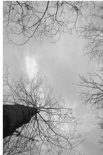
Figure 1. Crop tree after release.

In an unmanaged woodland, competition among trees for light, water, and nutrients is often severe and can result in slow growth or even the death of the more desirable trees. In a woodland under crop-tree management, these crop trees are freed from excessive competition by reducing or eliminating some of the less desirable competing trees. The released 1 crop trees are healthier and more vigorous, more insect and disease resistant, grow faster, and produce additional landowner benefits.